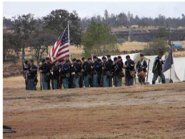
Scenes from a previous Civil War Reenactment

Upon the subject of education, not presuming to dictate any plan or system respecting it, I can only say that I view it as the most important subject which we as a people may be engaged in.